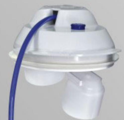
Point of Use Kit