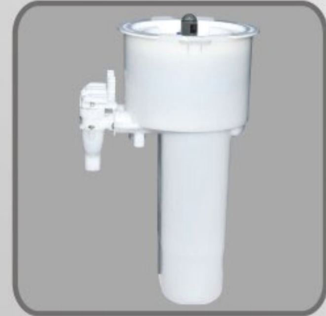
Removable Reservoir/Faucet Assembly (patent pending)