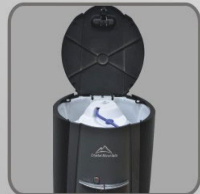
Retrofitted to Become a Point of Use Dispenser