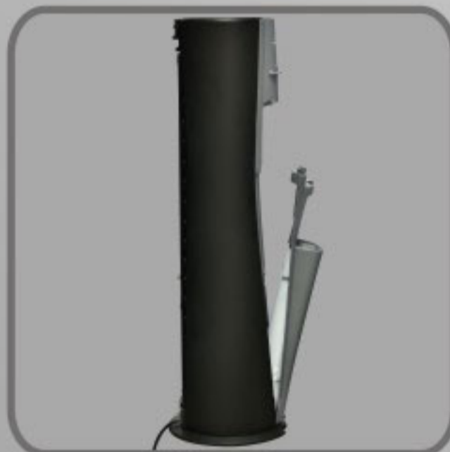
Replaceable Lower Front Panel with Optional Integrated Cup Dispenser